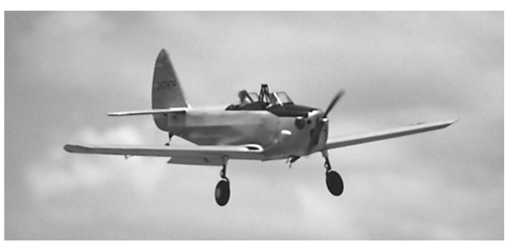
PT-19 in a late WW2 color scheme by Bill Brucken at the Mint Julep. Powered by an O.S. 1.08 2-stroke.