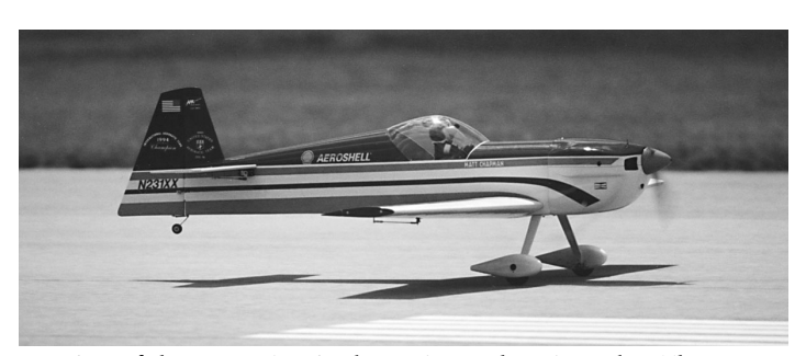
One of the many Fun Scale entries at the Mint Julep. These event are popular with scale modelers.