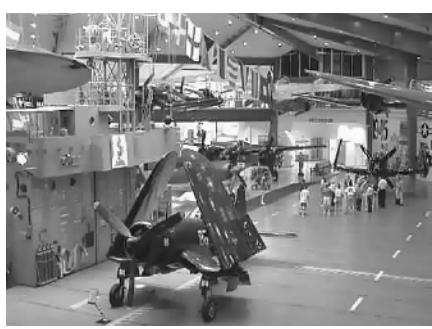
The Museum's west wing houses an exact replica of the flight deck and superstructure of a famous CVL, or light carrier, the USS Cabot, CVL-28. Its extensive combat record is proudly displayed just as painted on the original ship – and by the original artist.

It's simple, unlike all of the other museums, you can eat off the floor, its so clean, the airplanes are accessible and not totally roped off to where you can't get close to the airplanes to take photos. Much of this is due to the army (or I guess I should say Navy) of volunteers who work there. It's well lit, in fact it's one of the best lit museums anywhere in the world. Most of the aircraft that the U.S. Navy flew, or fly now, is either inside or very near. For much of the museum there is a upper deck which allows you to look out over the top of many airplanes or obtain different views for photos. They have an ongoing restoration facility very close and continue to work on various different and rare types of aircraft full-time.