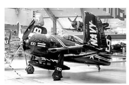
The Museum's F8F-2P Bearcat served at NAS Pensacola, FL, during its operational career. It is a photographicreconnaissance version of the Bearcat, one of only 60 built.