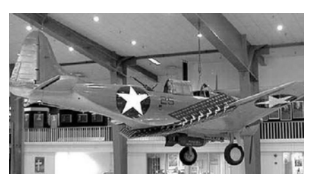
Following WW II combat operations from Guadalcanal, the Museum's SBD-3 aircraft was returned and subsequently lost in Lake Michigan while conducting carrier qualifications for new pilots. Located many years later, the aircraft was recently recovered and restored to its present condition.