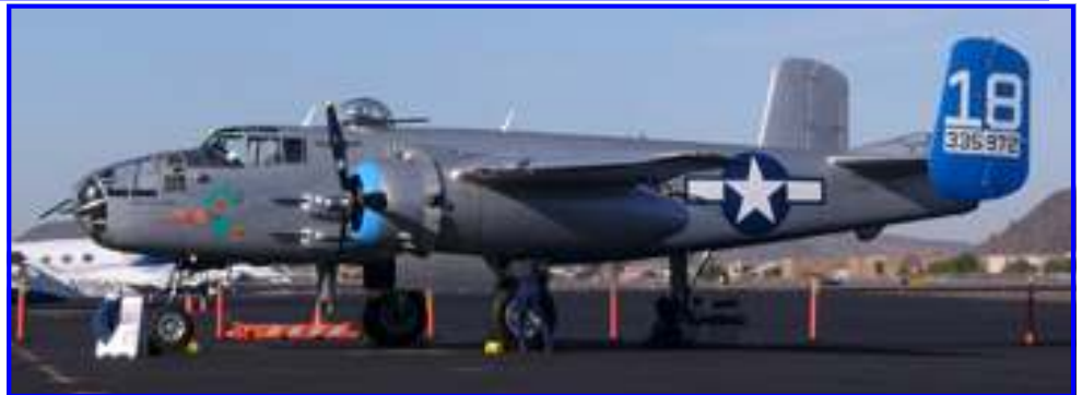
Sightings: Local flying field and local airport. Commemorative AF